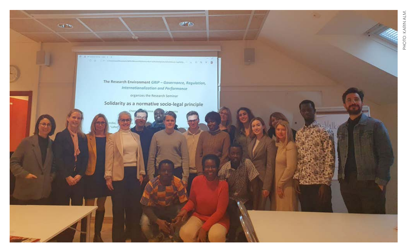
Professors and students attending the research seminar Solidarity as a normative socio-legal principle.