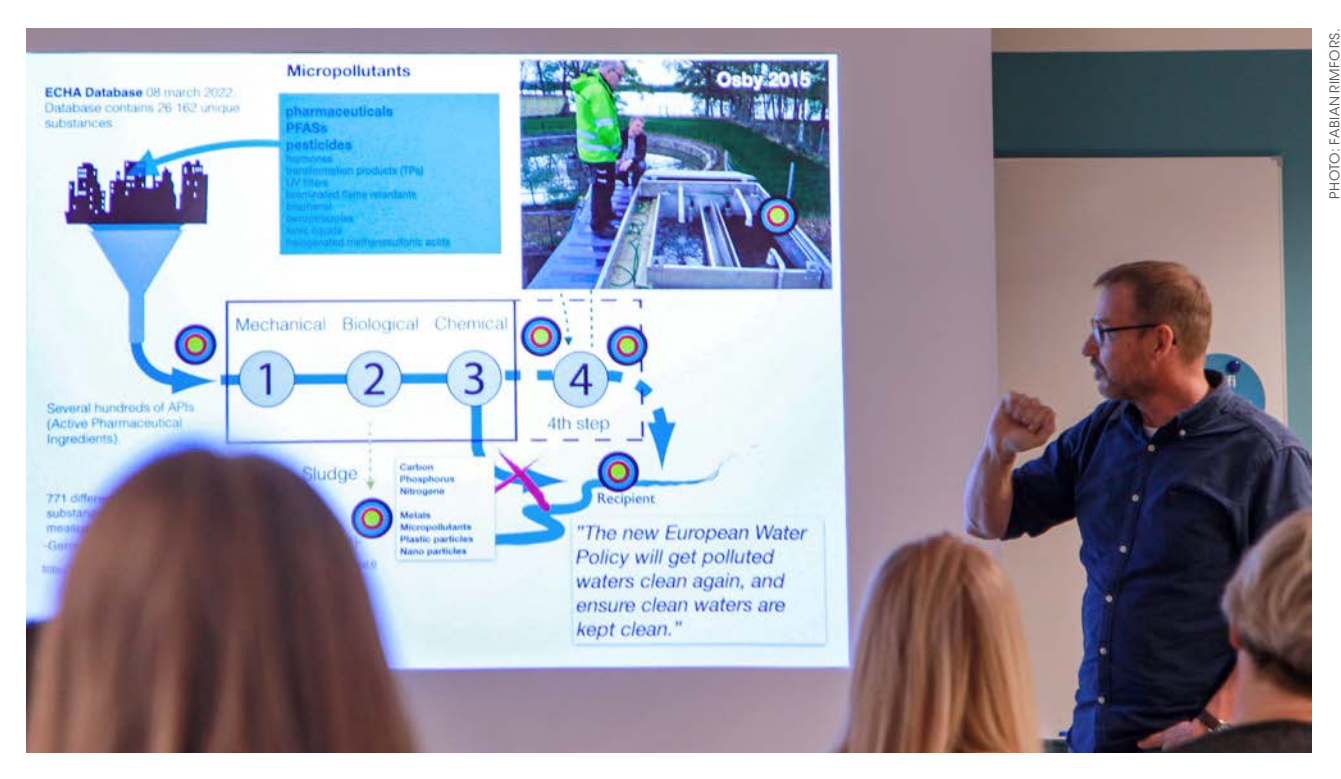
Here the researchers present a fourth purification step to the Baltic delegation. The new fourth purification step with granulated activated carbon (GAC) takes place after the three traditional steps of mechanical, biological, and chemical purification.

The second recent example from SMULA considers societal disconnection from nature as a critical problem that requires going beyond individual behavior and demands collective attention. The perspective is grounded on the idea that sustainable transformations require a sense of belonging to the whole of nature; people as part of nature facilitate a deeper understanding of the human role and responsibility in environmental problem-solving. Too often, we focus solely on individual behavior change to the neglect of the role our institutions, economies, and power structures play in shaping behavior.