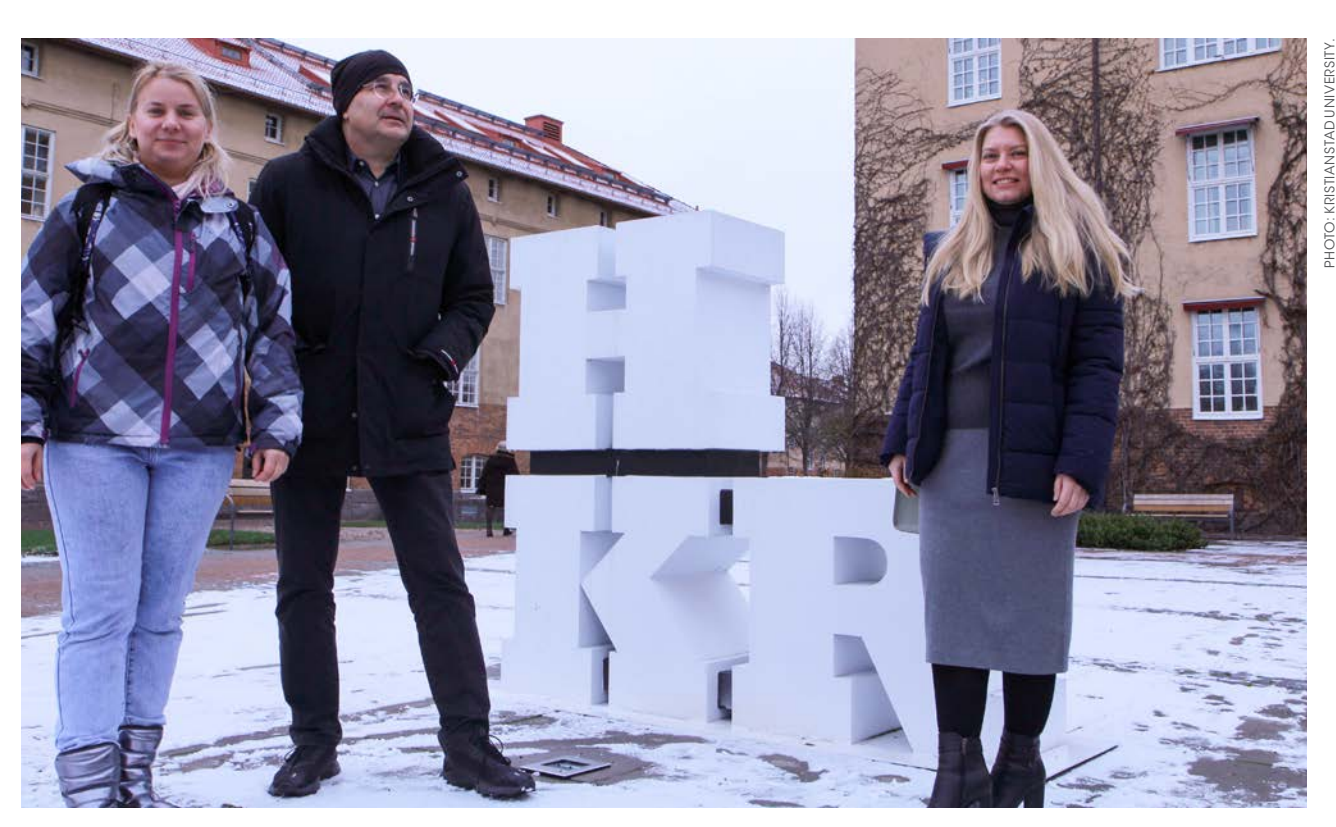
The new research group from Ukraine now have the opportunity to continue their work in Sweden, in collaboration with our Professor in Public Management and Accounting at the Department of Business administration.

Deal". The ambition is zero pollution; therefore, the Urban Wastewater Treatment Directive must be revised. By 2040, all water released from treatment plants for 100,000 people or more must be free of pharmaceuticals, pesticides, antibiotics, PFAS, and other harmful substances.