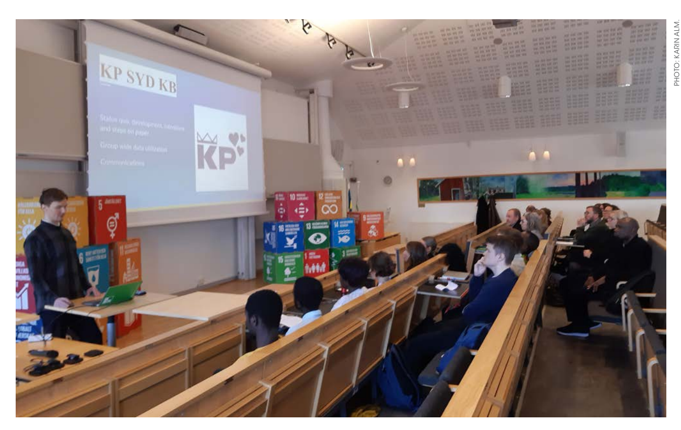
The Sustainability Day 2023! During the event all WIL-project groups presented their findings to our engaged WIL- organizations.