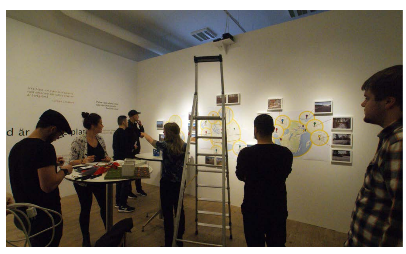
Young design students face their future in relation to global challenges.

We in parallel investigate how our design students deal with the ideas of sustainability, how young design students face their future in relation to global challenges. Many disciplines have nature and nurturing to explore, create and tell stories about possible worlds. Design is one activity of creating the future, not solving old problems as much as inventing new opportunities, still with strong ties to empirical science and engineering but also with the storytelling of branding and marketing. In parallel, industries and design have evolved from producing products to services, and recently to experiences, expressing basic human tenets to create and tell stories. This of course is at the core of fiction, helping us make sense of what it means to be human, how to plan and live our lives, and to find some purpose behind our journey.