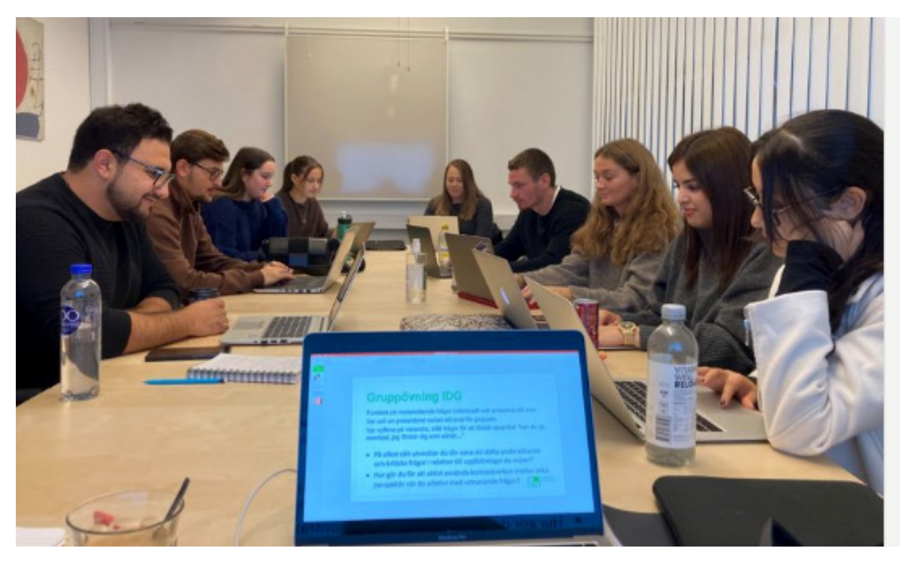
First year students on the course introduction for Human Resource and Workling Life Conditions programme – individual perspectives on the Inner Development Goals. Read more on page 18.