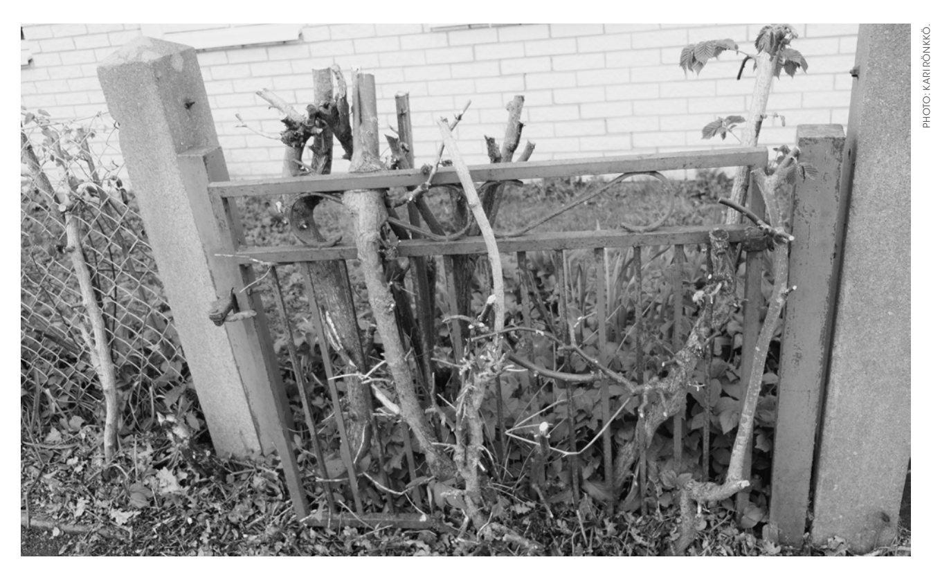
The research project Climate-Smart Näsby has the general aim of reducing the climate impact of the urban development taking place in Näsby.

Design , through which – across a space from digital design practice to the designed digital artifact – we explore the domains of experimental, critical, and commercial design. This through conducting design and design research into and through the education and professional practice of the digital designer, thus creating designerly knowledge about the making and theory of digital design.