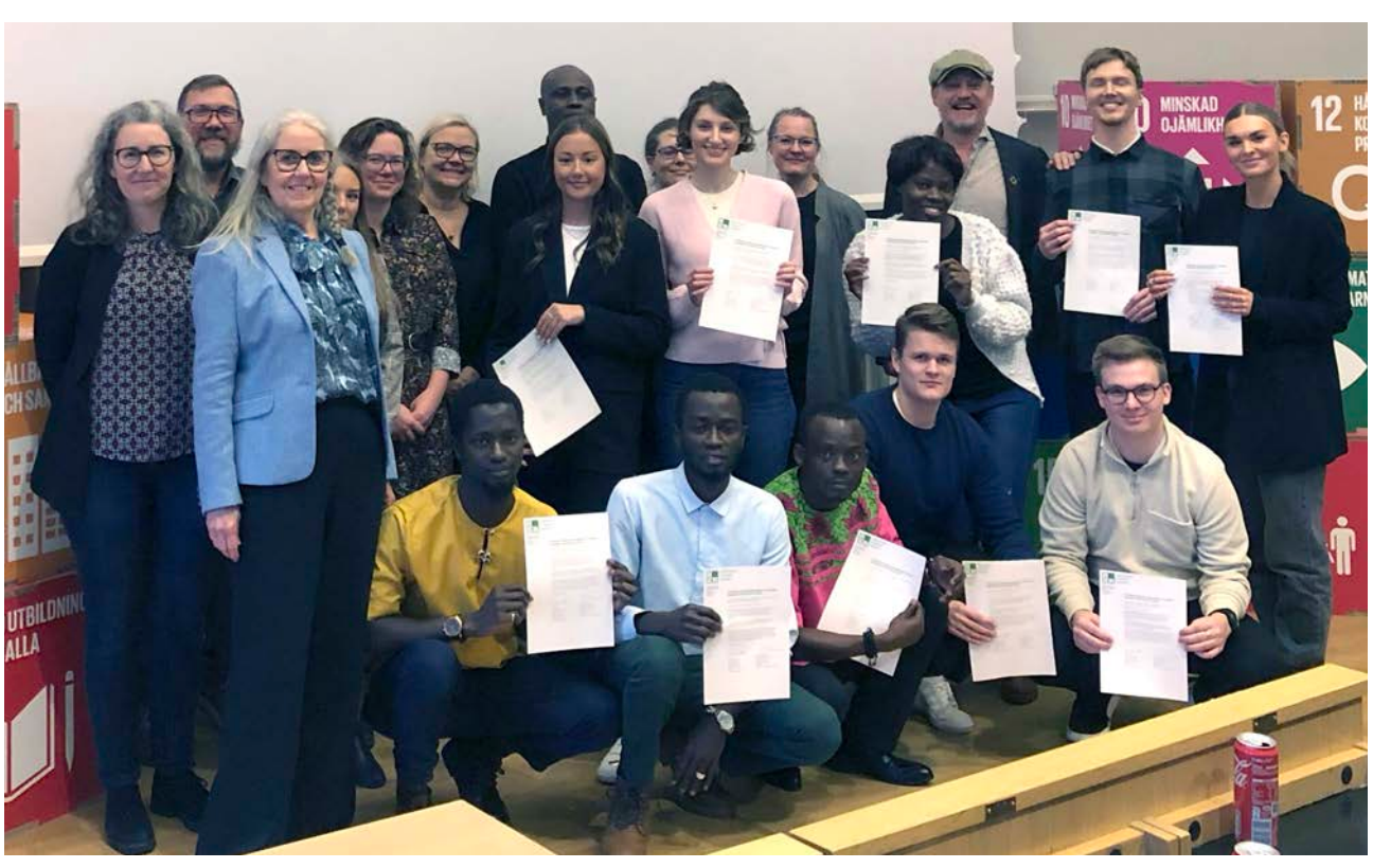
Thank you to our partner organisations for your collaboration and fantastic engagement throughout this sustainability project and at the master students Diploma Ceremony 2023!